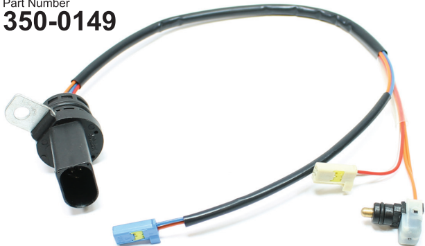
Wire Harness with 6-Pin Connector (2004-2014)