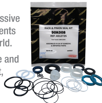
Automatic Transmission Overhaul Kits and Power Steering Kits

Better parts, better performance, better coverage and better support. That's a hard combination to beat, and only available from Freudenberg-NOK.