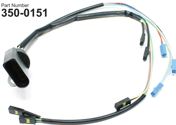
Wire Harness with 14-Pin Connector (2003-2014)